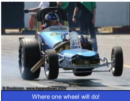
Where one wheel will do!