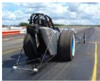
Destiny back on song at York